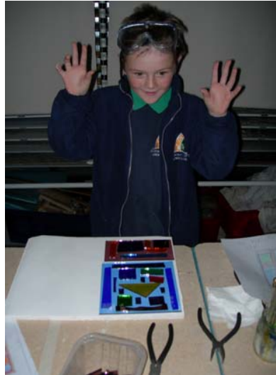
Voila! A satisfied pupil