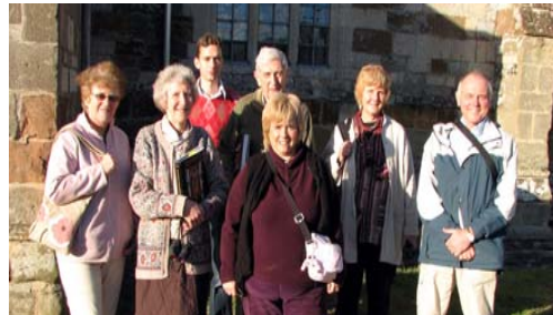
The Staff Team Outing