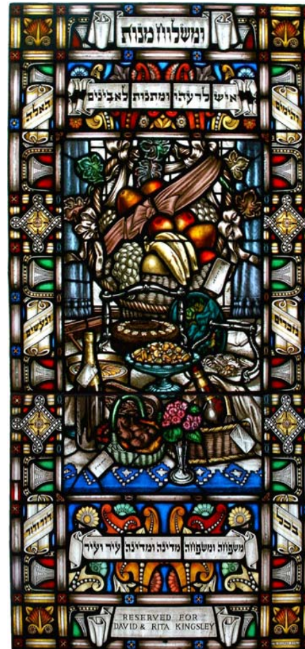
Festival of Purim David Hillman 1954

David Hillman (1894-1974), himself a man of great religious learning, was the son of a rabbinic judge. He overcame paternal disapproval of the artistic profession, becoming a portrait artist before turning his hand to stained glass. While some of his other designs test the limits of the Old Testament prohibition against idolatry and 'graven images', this window is more traditional in avoiding the representation of the human form altogether. It celebrates the festival of Purim, whose festivities resemble those of Christian pre-Lenten carnival (Pancake Day in England). The Hebrew inscriptions quote the origins of the feast in the Old Testament Book of Esther.