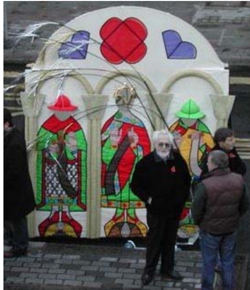
The Walking Window

Eels will be the flavour of the day on Saturday 28 April for Ely's Annual Eel Day. Starting at 12.00 noon from Cross Green (adjacent to the Cathedral), Ely's new 'Ellie the Eel' will be heading the carnival procession along part of the City's Eel Trail Heritage to the Waterside and into Jubilee Gardens where a whole host of eel related activities will be held.